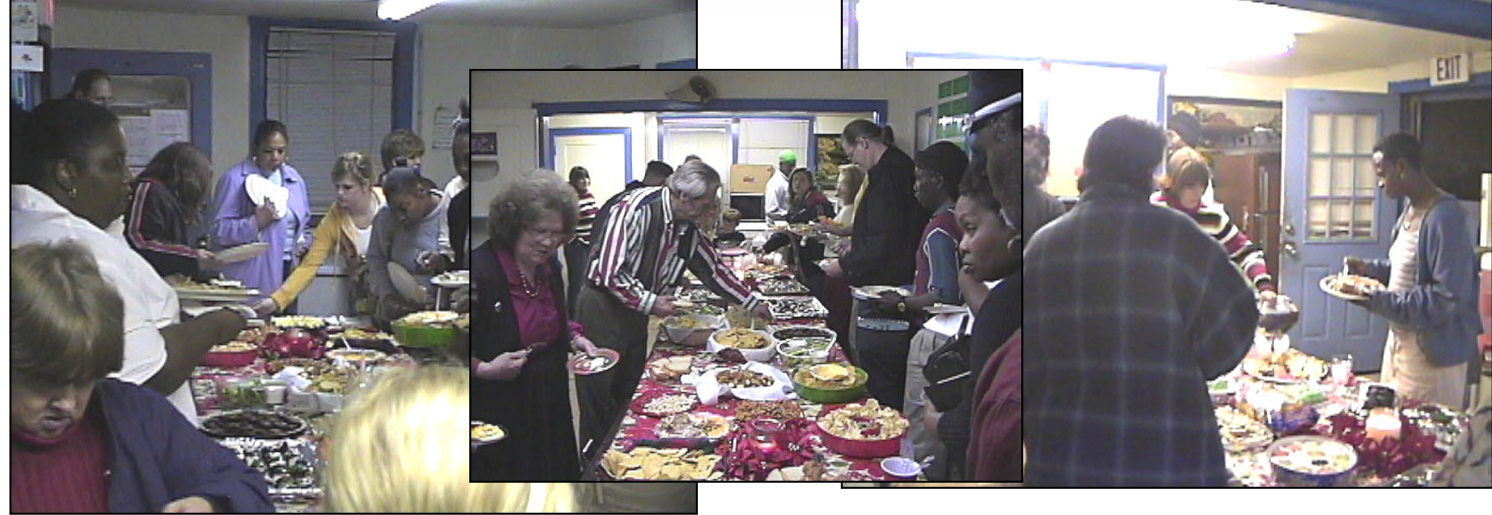
Our Friends At Ivey's Outdoor And Farm Supply Brought Gifts For All The Mission Residents